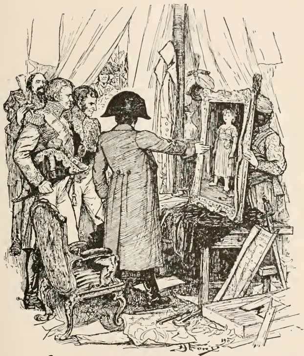
Napoleon Shows the portrait to the Generals

Louise herself sends a full-length portrait of him by Gérard, which arrives on September 6, 1812, the day of the battle of the Moskowa. For an instant Russia ceases to exist for Napoleon: the world holds nothing